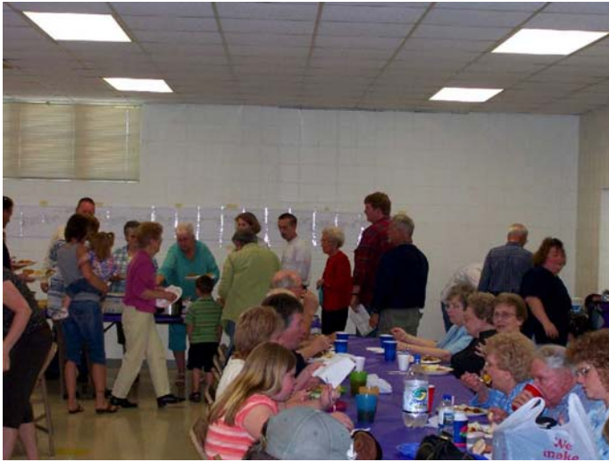
Everyone getting in line to see what is on the menu.