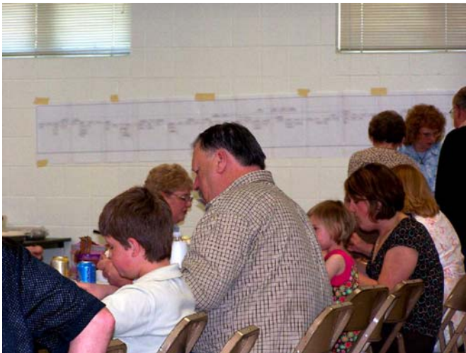
More of the families enjoying the 2008 Lael Reunion.