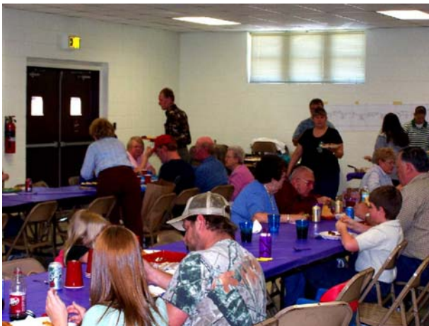
Some of those in attendance.