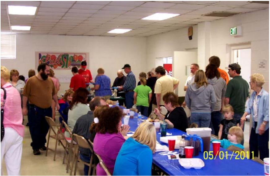
Getting in line to make sure everyone gets a taste of their favorite dish.