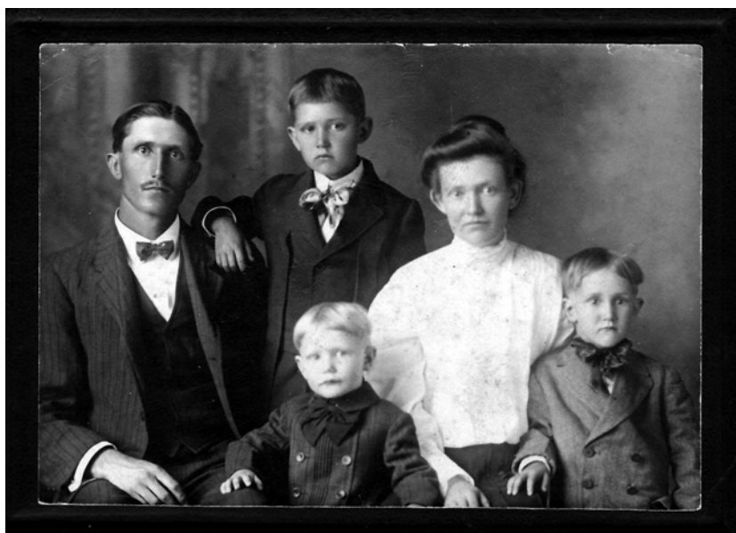
I could use some help to identify everyone in this photograph taken in the early 1900's.