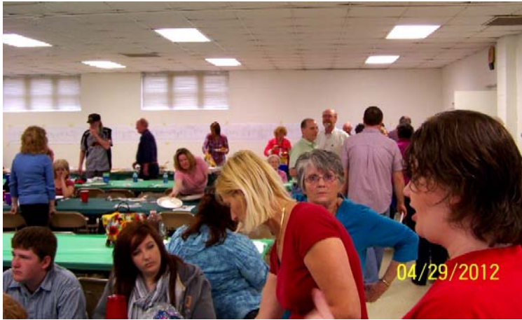
More families arriving for the Reunion