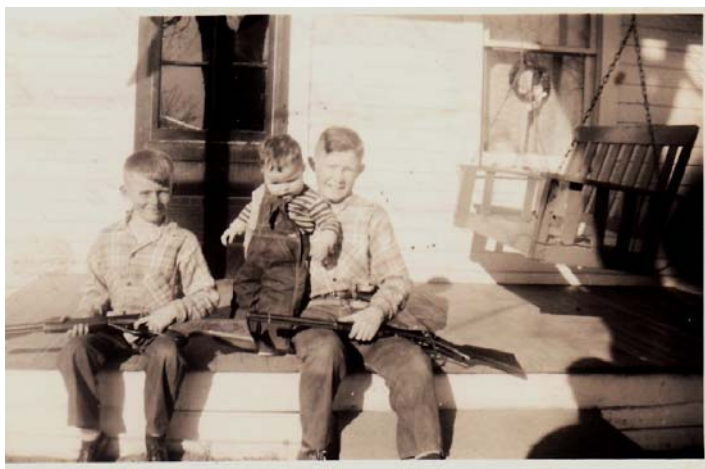
It looks like some of the boys have a Daisy Red Ryder BB gun