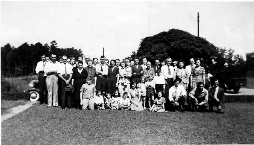
I can identify a few people in this photograph. It would be nice if we could name everyone.