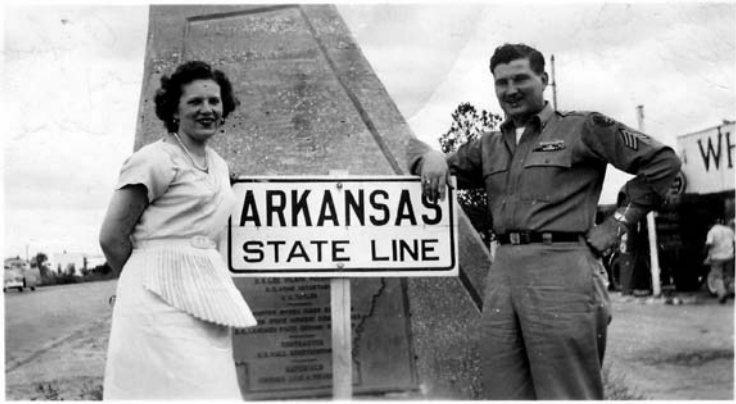
What a handsome couple.