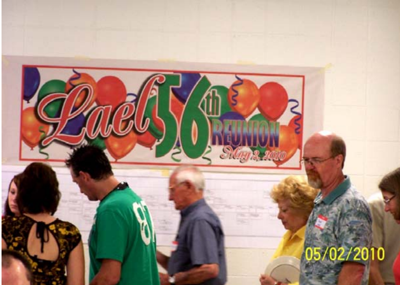
The 56 th Lael Reunion