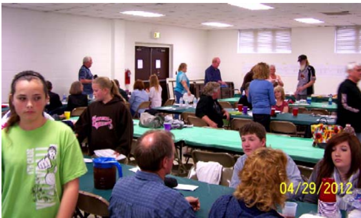
Getting settled in before lunch.

I intend on having copies of the 1940 Census pages, available for the 2013 Reunion, for as many family groups as I can find. I will still not be able to see myself in this Census since I just missed being born in 1942.