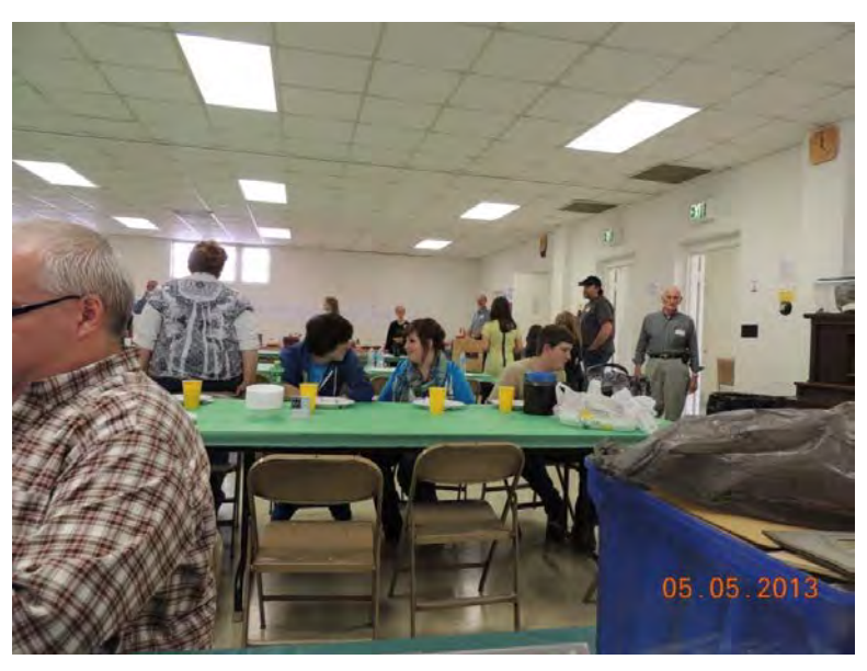
People starting to arrive just before Noon

We had another good turnout and the good weather probably helped the attendance. The potluck meal was as great as it always is. I'm sure we all have favorites foods that we look forward to sampling each year.