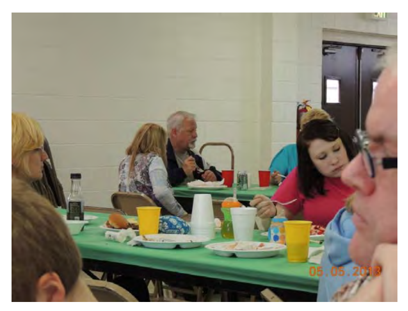
You can always go back for seconds