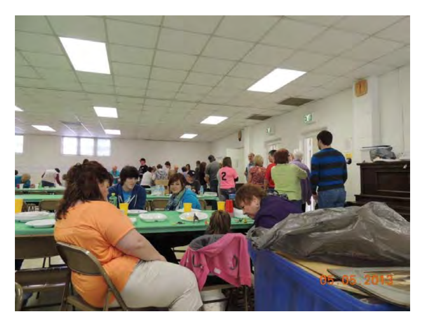
Getting in line