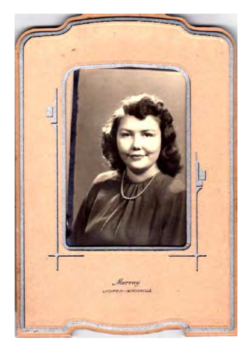
Daughter of Owen Lael