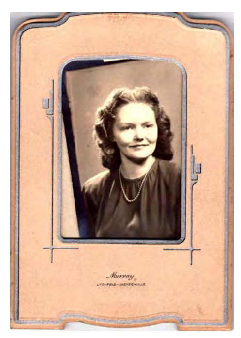
Daughter of Owen Lael