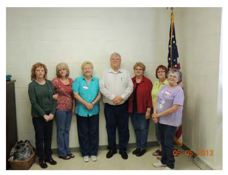
Lael family cousins